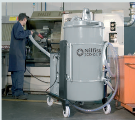
Machine tool maintenance in few seconds