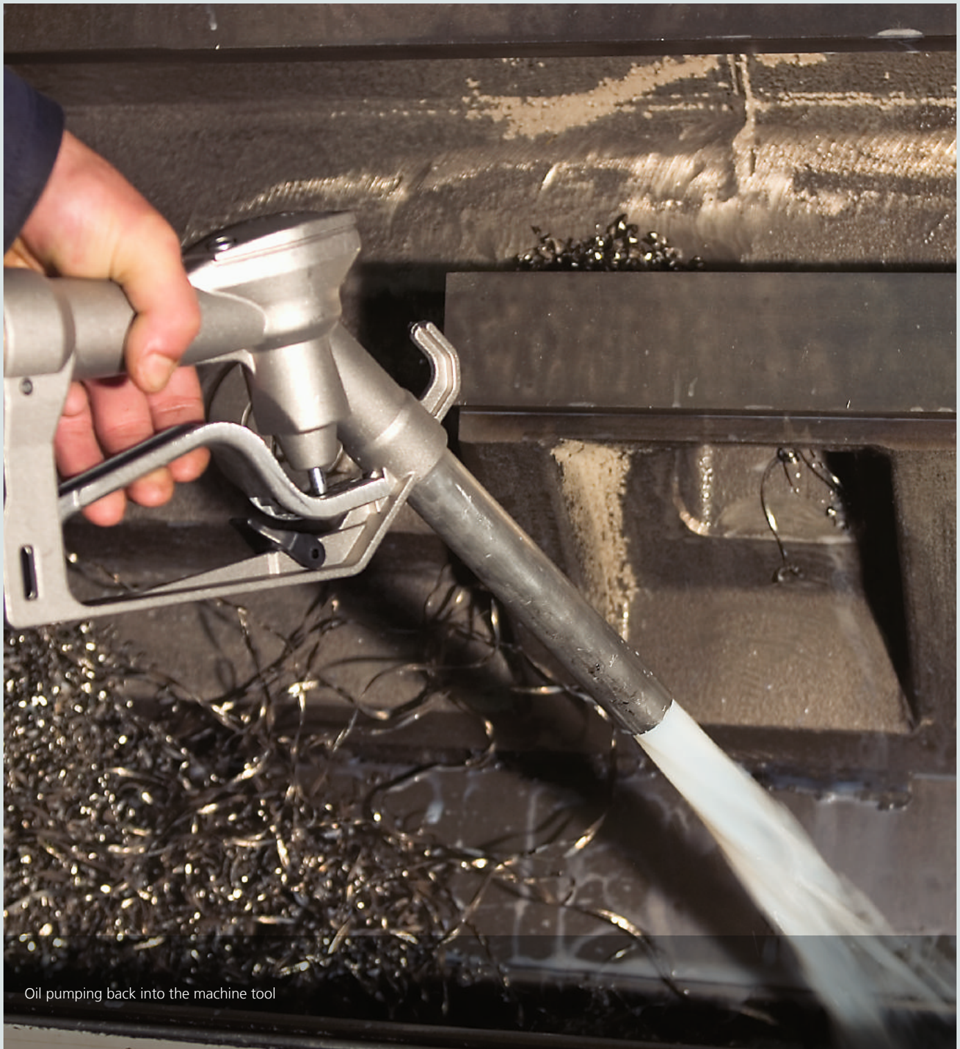
Oil pumping back into the machine tool