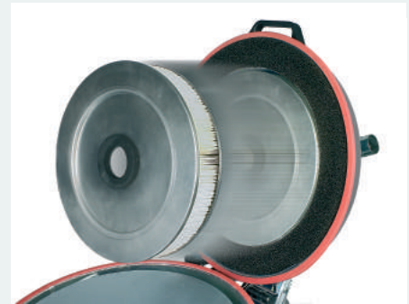
Filter for oil mists. It prevents particles of oil and water from becoming airborne