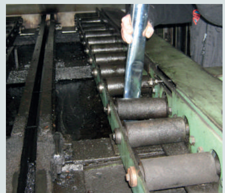
Vacuuming grinding sludge