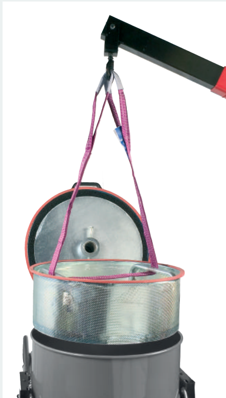
Belt for easy lifting and emptying