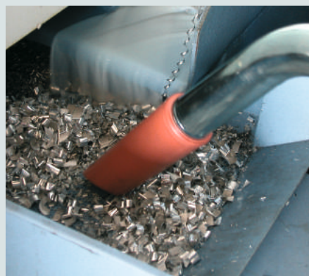
Collection of large quantities of chips