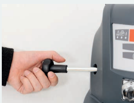
Manual filter shaker