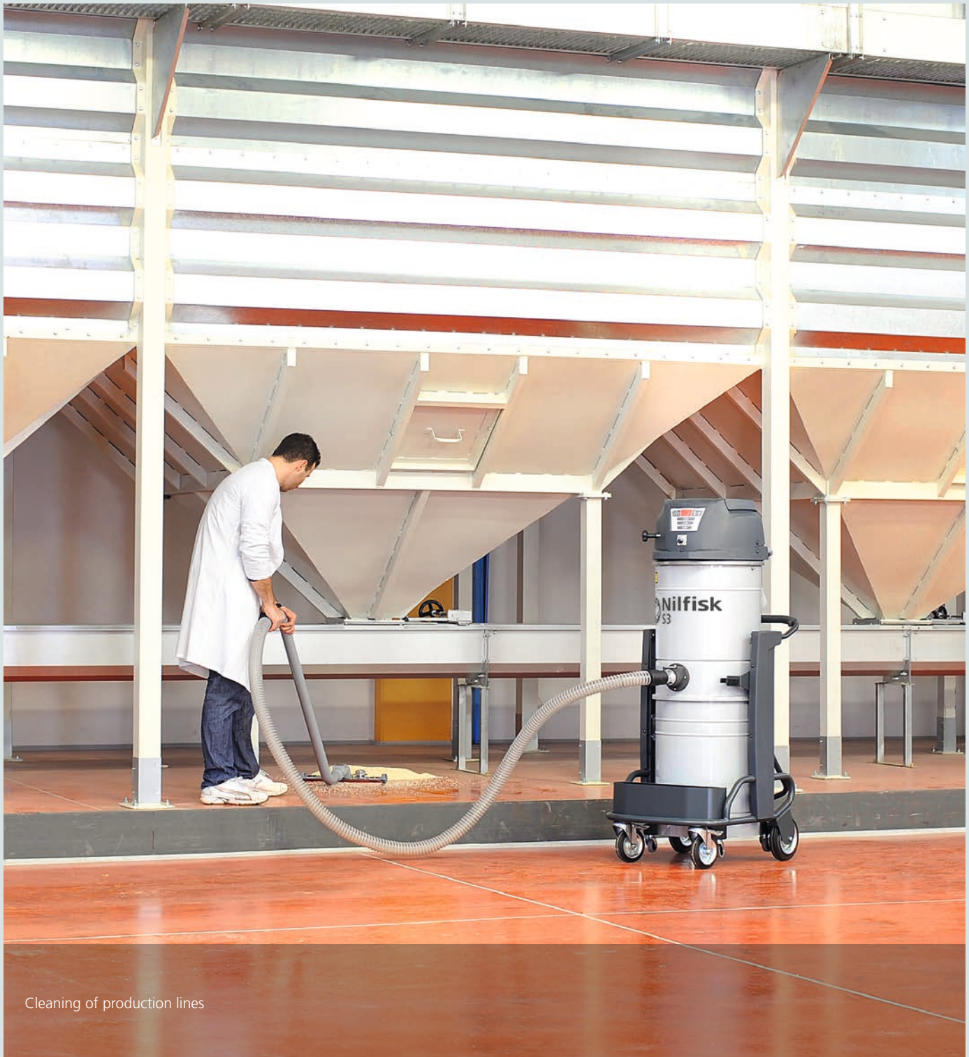
Cleaning of production lines