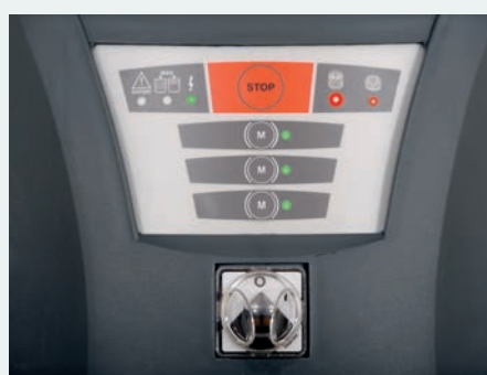
Electronic board control