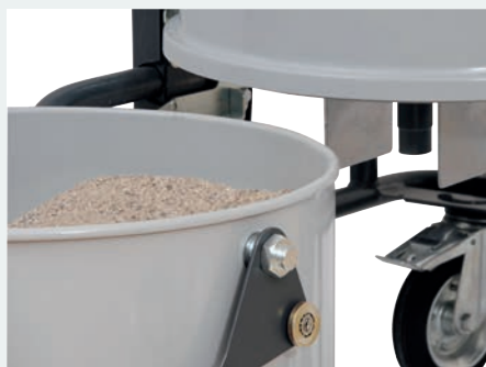
Solid cut-off system