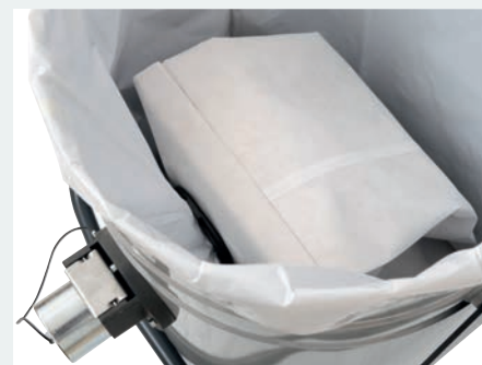
Safe bag for toxic material