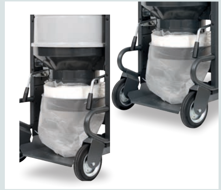
S3 with gravity unload system with Longopac®