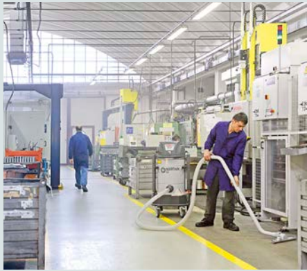
Cleaning of a metal company